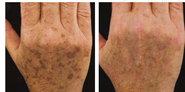
By courtesy of A. Pulvirenti - Catania, Italy.

As a result of its speed and precision, Minisilk FT gives the skin a trauma-free and scalpel-free general lifting effect with short recovery times. The pulsed light stimulates the production of new collagen and improves skin tone, texture and glow.